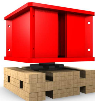
Step 4: extend jack and raise load