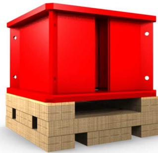
Step 2: Insert timbers on the sides