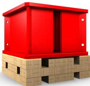
Step 3: retract piston and insert timbers