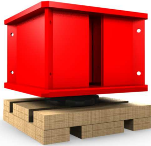
Step 1: extend jack and raise load

The 500te Climbing Jack is the largest capacity jack in the climbing jack series. At maximum capacity 9 timbers per layer are required. Please contact ALE for further information on allowable jacking heights and stability.